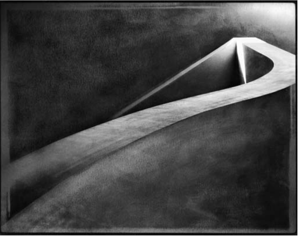
Street Project. I wanted to represent how light falling on a three-dimensional interior space would be transformed into a two-dimensional art form, rendering the sculptural space an abstract series of images. This is typical of my work in that it represents my interest in architecture and